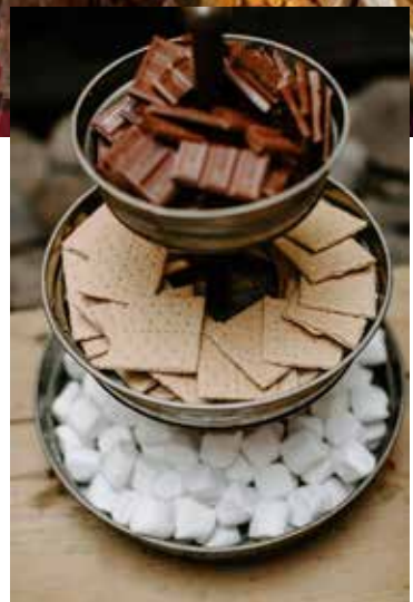
Smore bar or stations located at the fire pit gathering areas with roasting sticks so guests can make their own smores after dinner.