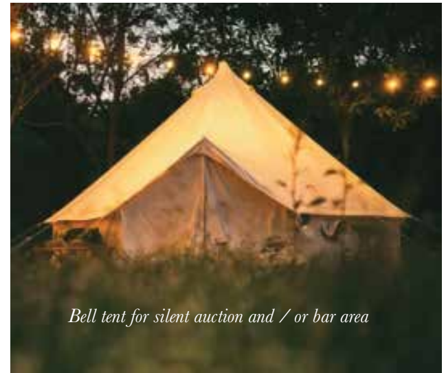
Bell tent for silent auction and / or bar area