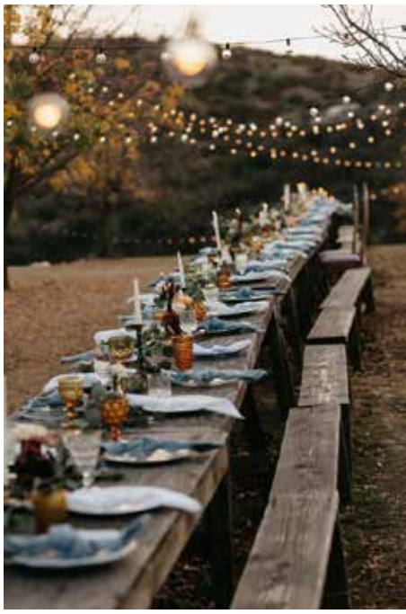
Long picnic table dining with butcher paper table runner and string lights overhead.