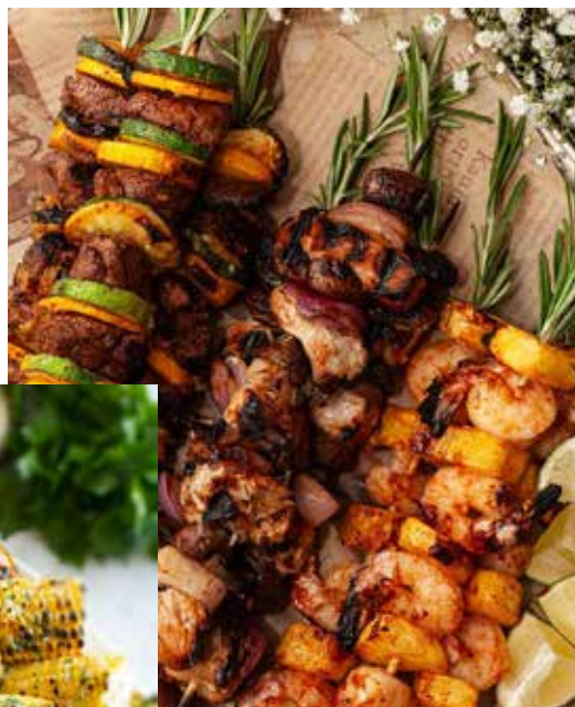
Camping "charcuterie" Layed out on butcher paper with hand written labels