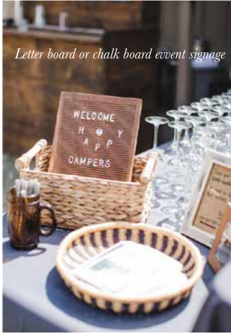
Letter board or chalk board event signage

Combining the elegance of a gala with the rugged beauty of the Ukiah Valley outdoors to create a unique and memorable experience.