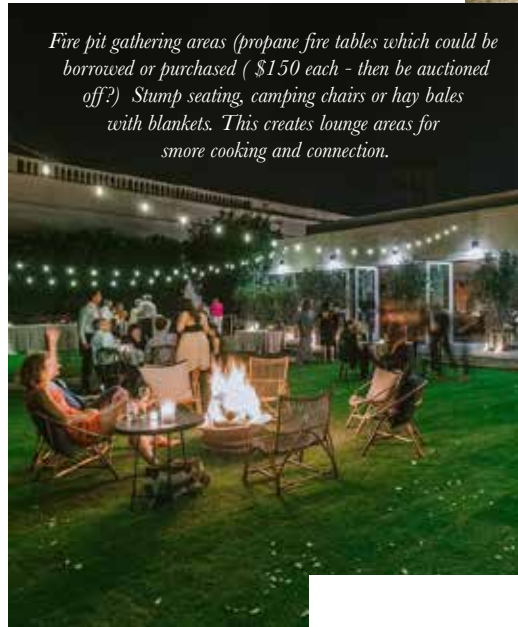
Fire pit gathering areas (propane fire tables which could be borrowed or purchased ($150 each - then be auctioned off?) Stump seating, camping chairs or hay bales with blankets. This creates lounge areas for smore cooking and connection.